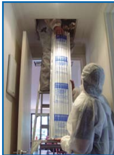
COMPACT FOR EASY HANDLING & INSTALLATION