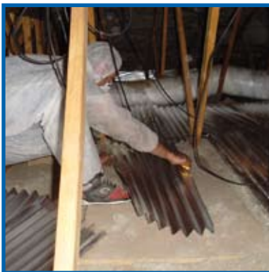
EASY DIY RETROFIT