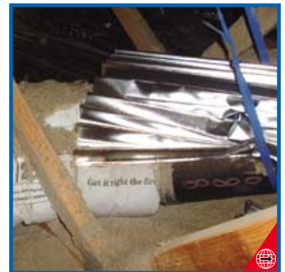
RADIANT BARRIER AROUND AIR-CONDITIONING DUCTWORK