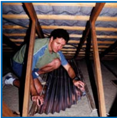
UNSTAPLED & TIMBERS VISIBLE

LAI D OVER FIBRE INSULATION – UPWARD & DOWNWARD AIRSPACES CREATED – REDUCES CEILING TEMPERATURE